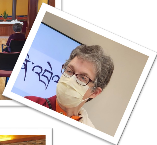
IACO Interfaith Visit to KTC Buddhist Temple