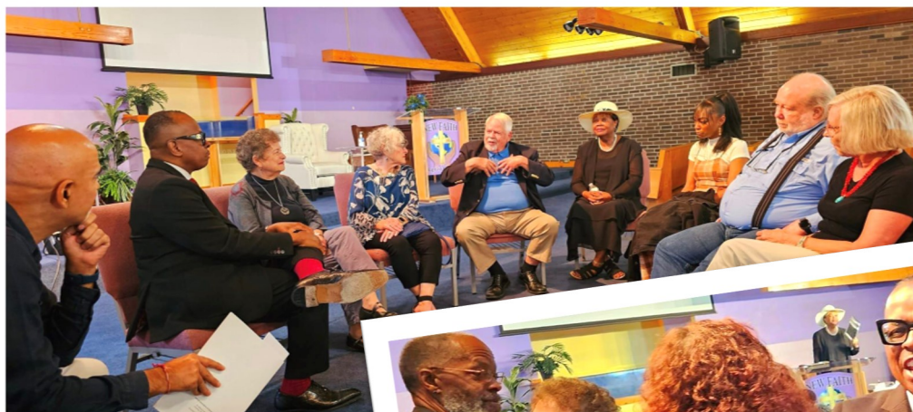
IACO Interfaith Visit to The New Faith Baptist Church